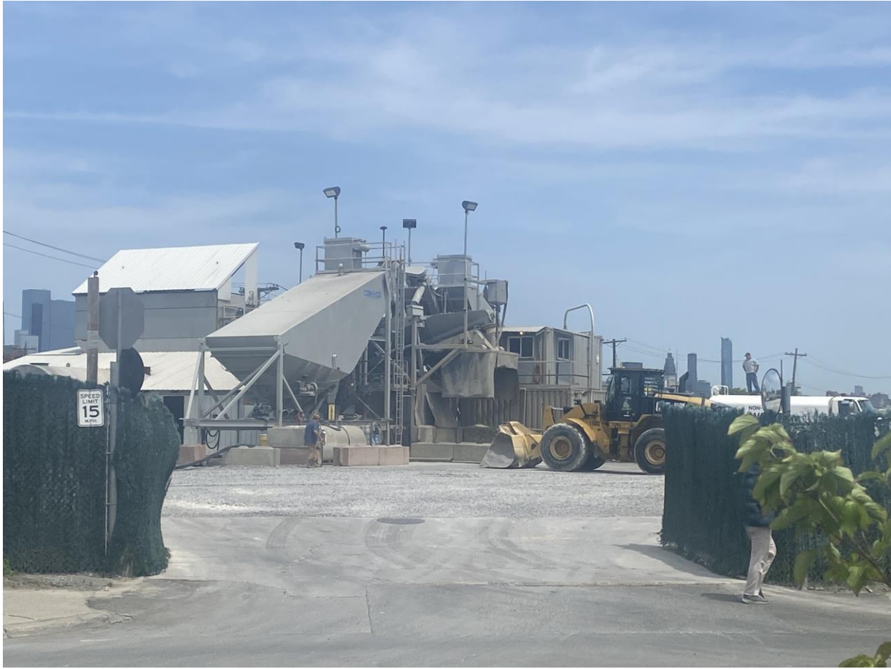
Photograph A - Taken 5.17.2023