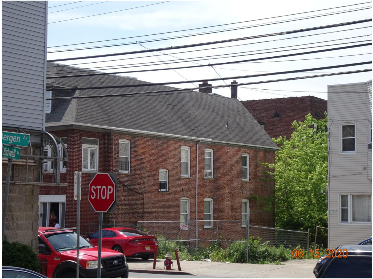
Photograph A – Site Photo Looking Southwest from Bidwell Avenue