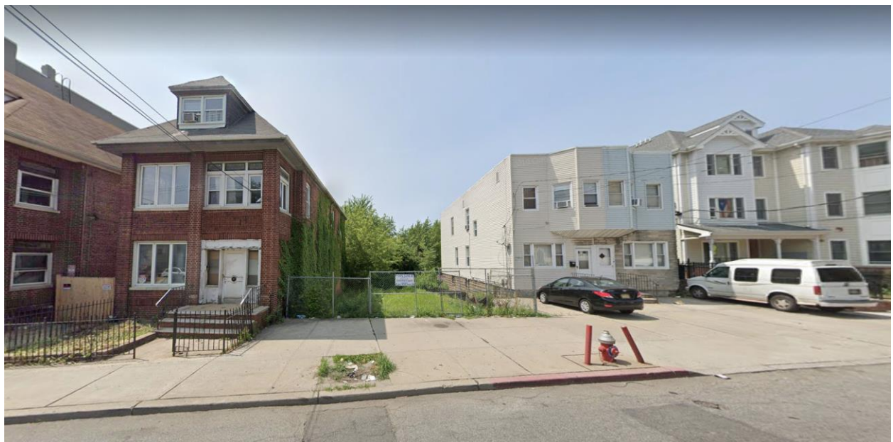
Google Street View Photo from July of 2019