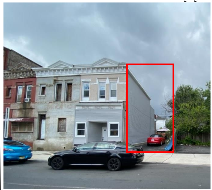
Applicant's Lot – Site Photo Taken 8.23.21– Red Outline Indicates Proposed Site